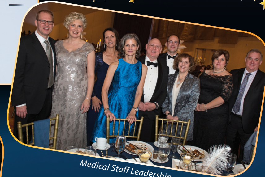
Medical Staff Leadership