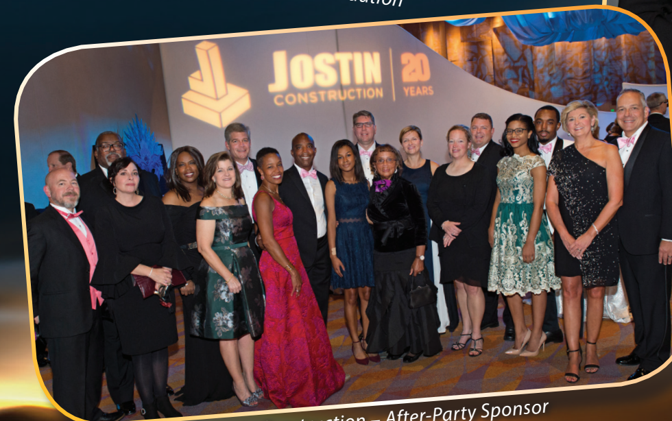
Jostin Construction - After-Party Sponsor