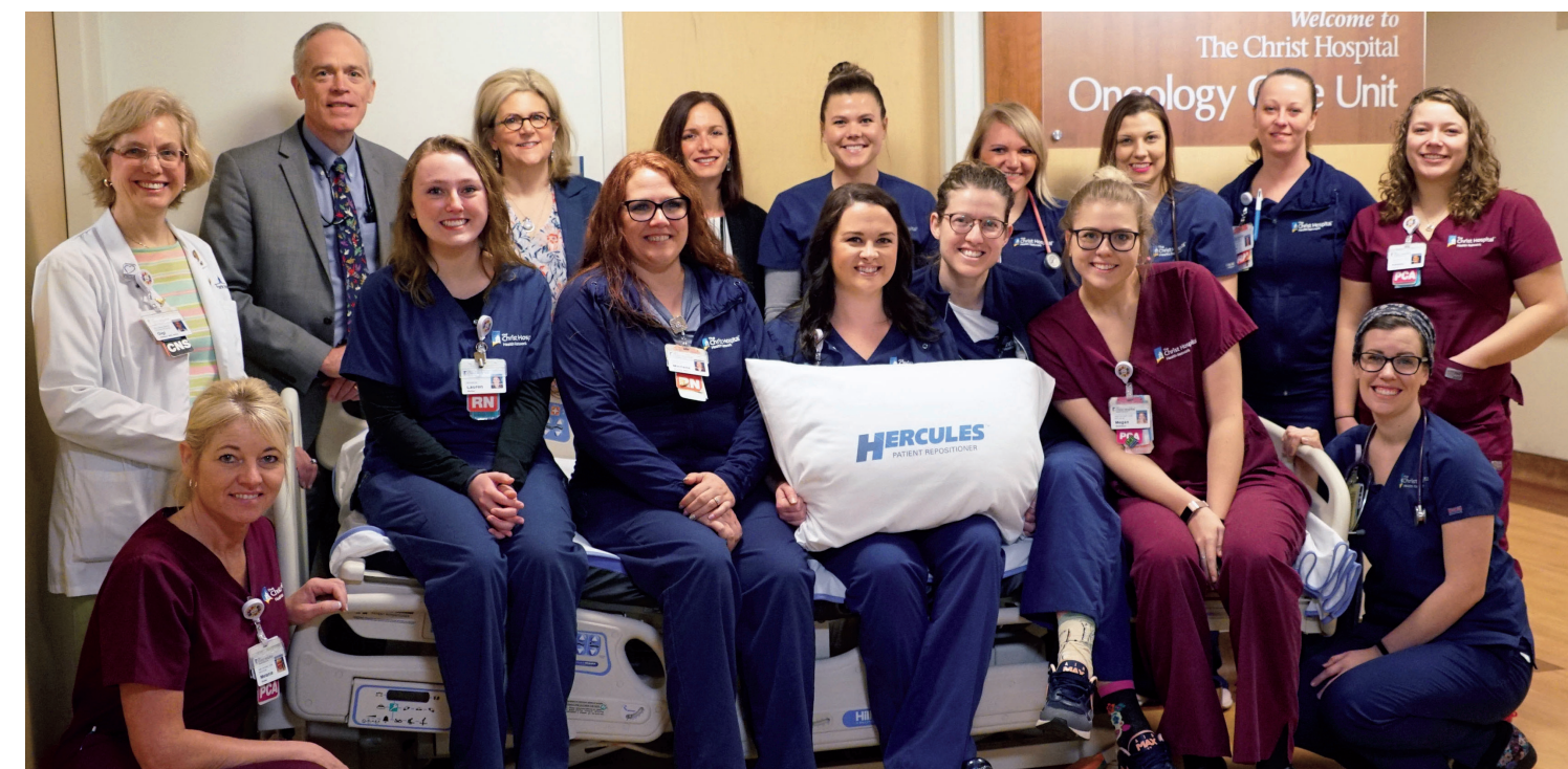
The Christ Hospital Inpatient Cancer Unit Clinical Team